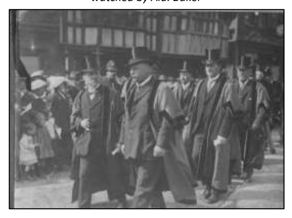
The Councillors & Officials arrive