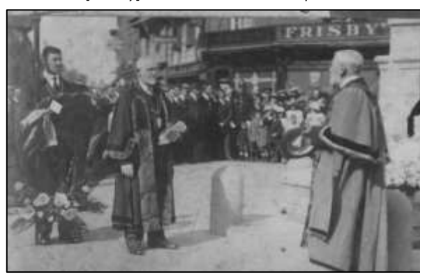
The Mayor pledges: "the present corporation and all succeeding corporations would guard it with jealous care and see that nothing untoward happened to it".