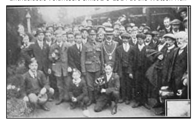
The Mayor gives his Blessing