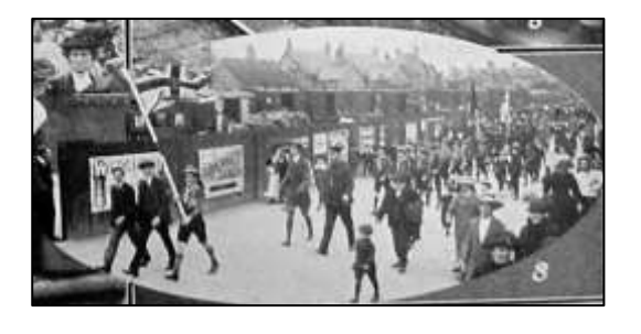
Scouts lead the Parade-past animal wagons