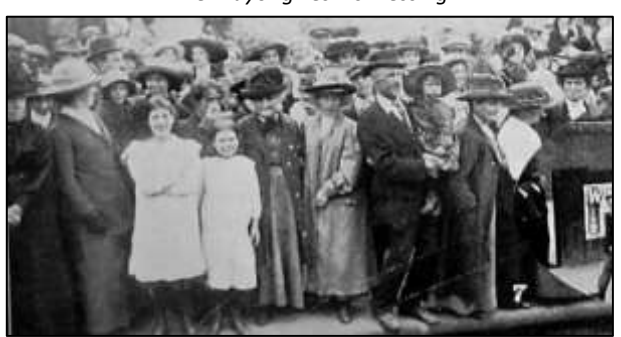
Those left Behind