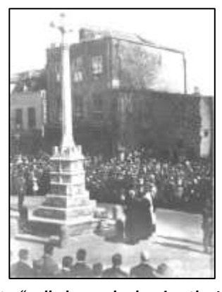
Mrs. Didcote "pulled a cord releasing the Union Jacks which draped the pedestal and they fell away ...". The Plaques were not added until 1926