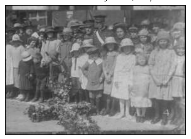
The [mainly] well behaved Children spectate