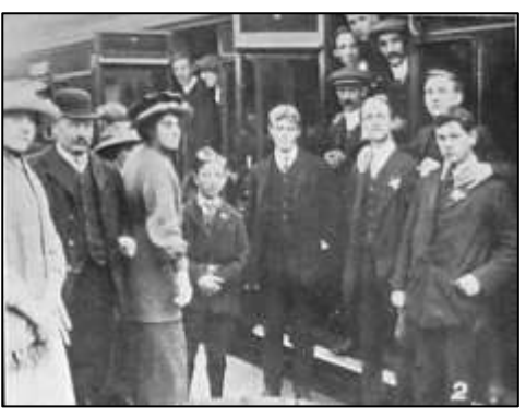
Volunteers in Best Suits wait patiently